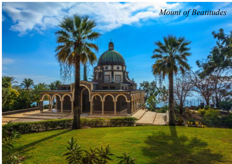
Mount of Beatitudes

Our morning begins after a breakfast buffet as we drive to the Sea of Galilee, passing by Magdala, home of Mary Magdalene. We enter the 2,000-year-old remains of Capernaum (Lk. 4:31-37) and stand in what is left of the synagogue in which our Lord ministered. We will also see Peter's house. We visit Tabgha, commemorating the feeding of the 5,000 (Lk. 9); Mensa Christi, where the Lord appeared to the disciples after the resurrection (Jn. 21); and the Church of Peter's Primacy. We stop at Chorazin and end the day at