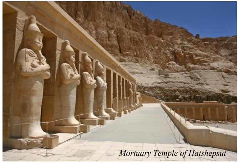
Mortuary Temple of Hatshepsut

After breakfast, we visit the famous Pyramids of Giza, built during the 3rd and 4th dynasties of the Old Kingdom. Enjoy an up-close view of the Great Pyramid, built for the Pharaoh Khufu, as well as the Pyramids of Khafre and Menkaure. We ride camels into the nearby desert for a different view. Not far from the Pyramids, we see the Mythical Sphinx of Giza, the legendary statue with the head of a human and the body of a lion, amazingly carved out of one huge piece of limestone. We have lunch at an authentic Egyptian food restaurant before continuing to Sakkara and the Step Pyramid. It is the first Pyramid and the oldest construction of stone in the whole world. We also observe wall carvings with daily life activities depicted on the Nobel Tombs. You may have the opportunity to explore the Pharaoh's Burial chamber. We return to our hotel for relaxing evening on our own. B/L