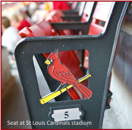
Seat at St Louis Cardinals stadium