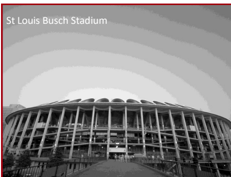
St Louis Busch Stadium