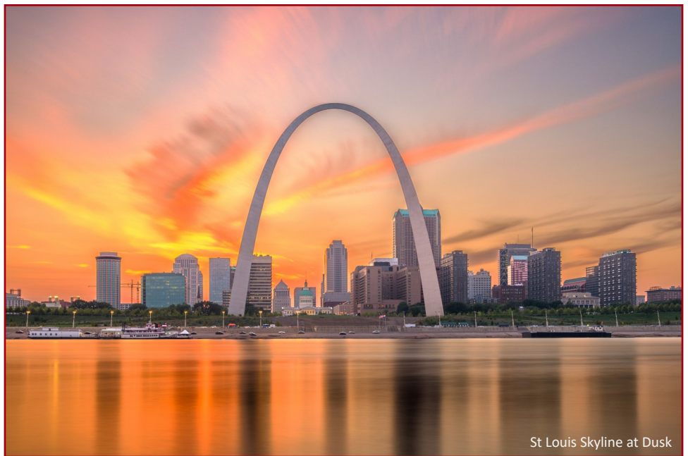
St Louis Skyline at Dusk