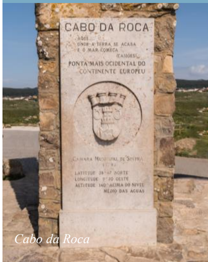
Cabo da Roca