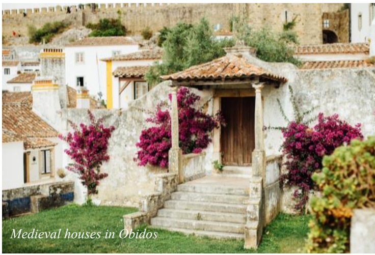
Medieval houses in Obidos

awakening at the Jewish museum. We'll also learn about olive oil, a local specialty and the many products from the regional cork tree.