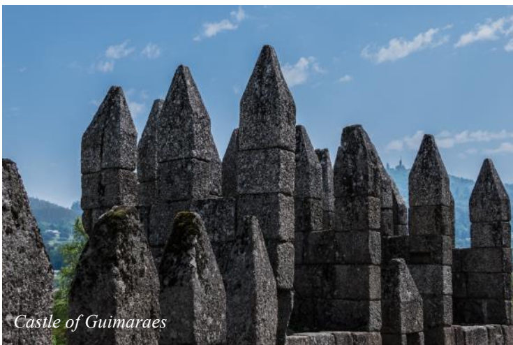
Castle of Guimaraes