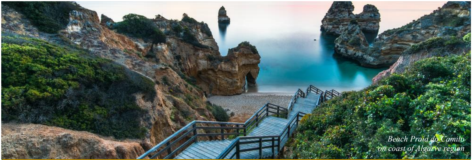
Beach Praia do Camilo on coast of Algarve region