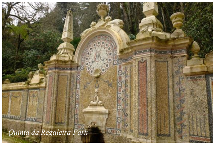
Quinta da Regaleira Park

at Cabo de Roca, the most Western point of mainland Europe, before a dinner of local seafood.