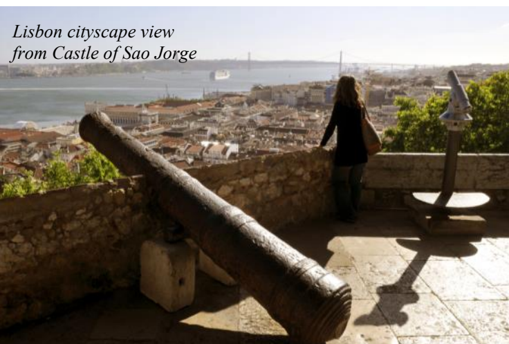
Lisbon cityscape view from Castle of Sao Jorge

After breakfast, we'll head out of the city for a visit to Sintra. Well known as a royal sanctuary, Sintra is dotted with royal palaces and villas. We'll tour the Palacio Nacional, the Castelo dos Mouros and Palacio da Pena. This afternoon, we'll explore the extensive grounds and caves at Quinta da Regaleira. We'll head down to the beach to watch the sun set