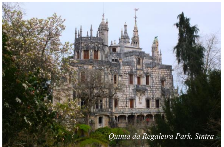
Quinta da Regaleira Park, Sintra

The Douro River is the lifeline of northern Portugal. We'll see the soaring cathedral, the stock exchange with a contemporary Arabian Hall inspired by the Alhambra in Granada. We'll pass through groves of grapes destined to become wine and the fortified port liquor named for the region. Guimaraes is often referred to as the Cradle of Portugal for its association with the country's first king. We'll tour the city's medieval center. Moving on to Belmond, we'll learn of the Jewish