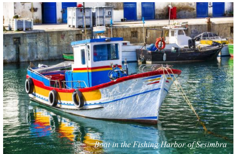
Boat in the Fishing Harbor of Sesimbra