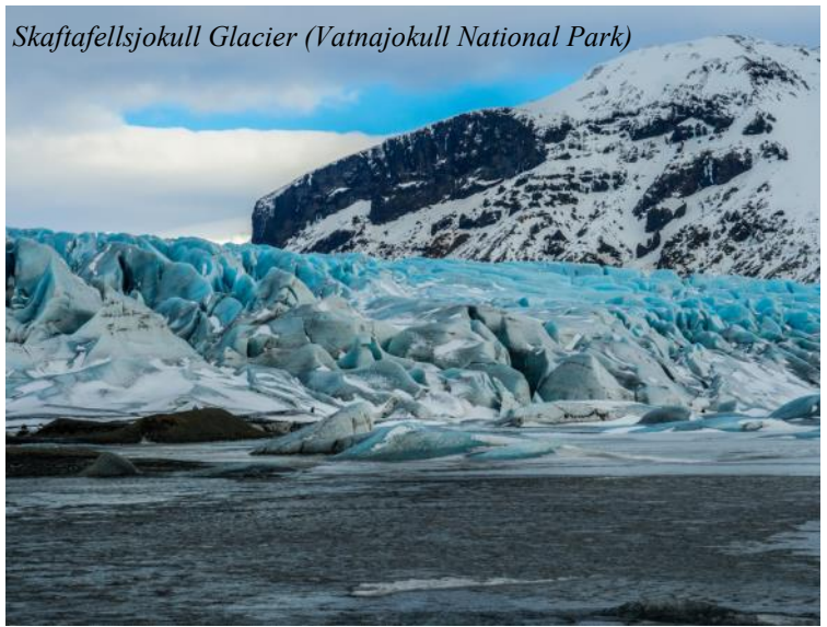
Skaftafellsjökull Glacier (Vatnajökull National Park)

In the morning we hike in a lava labyrinth at Dimmuborgir, "the dark castles", hoping to get a glimpse of the trolls who are said to live there. After lunch, on our own, we visit the hot spring area of Námaskarð with bubbling mud pools and steaming solfataras. We head through the uninhabited highlands and moonlike surrounding to East Iceland. With some luck we might spot an Arctic fox or a reindeer. We check into our hotel for overnight. B, D