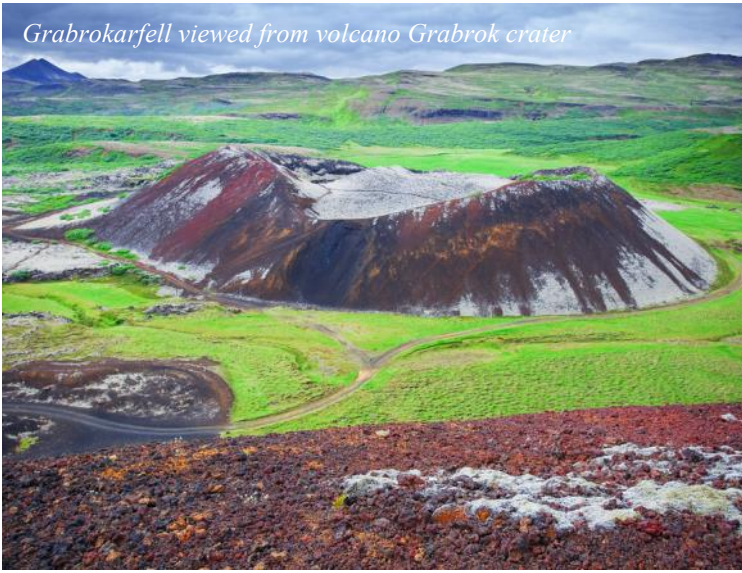
Grabrokarfell viewed from volcano Grabrok crater