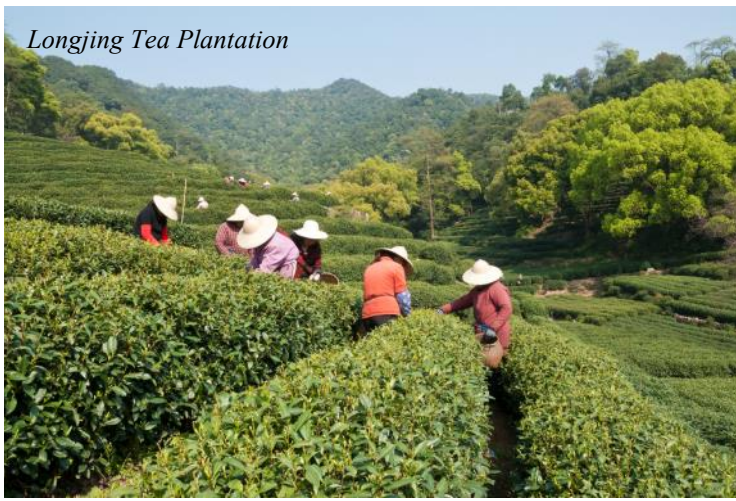
Longjing Tea Plantation

afternoon we board a flight to Hangzhou , the political, cultural and commercial center of Zhejiang province located in a beautiful, natural setting. B/L/D