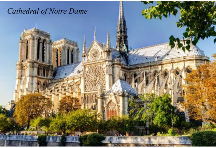
Cathedral of Notre Dame

Cathedral of Notre Dame de Paris , and of course, the Eiffel Tower . The afternoon is open to pursue individual interests, perhaps to visit one of Paris' world famous museums: the Louvre, Musée d'Orsay, or Centre Pompidou. B/D