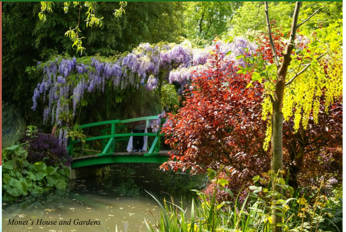
Monet's House and Gardens