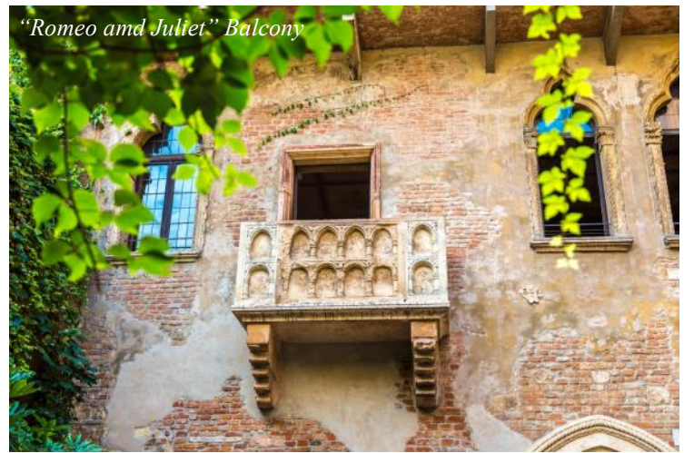
"Romeo and Juliet" Balcony

out into the Venetian Lagoon to Lido, for a wonderful evening experience. Some time on the Piazza San Marco without the hordes of visitors also makes for a very special evening. B/D