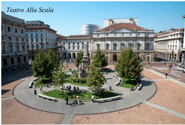
Teatro Alla Scala