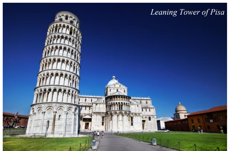
Leaning Tower of Pisa

Our entire day is devoted to Florence, "La Bellissima"– the "Most Beautiful One," "Cradle of the Renaissance", and arguably, the world's foremost art treasure! Whether it's the Duomo (cathedral) with its famed Baptistry , Giotto's Tower , the Pitti Palace , the Accademia with Michelangelo's