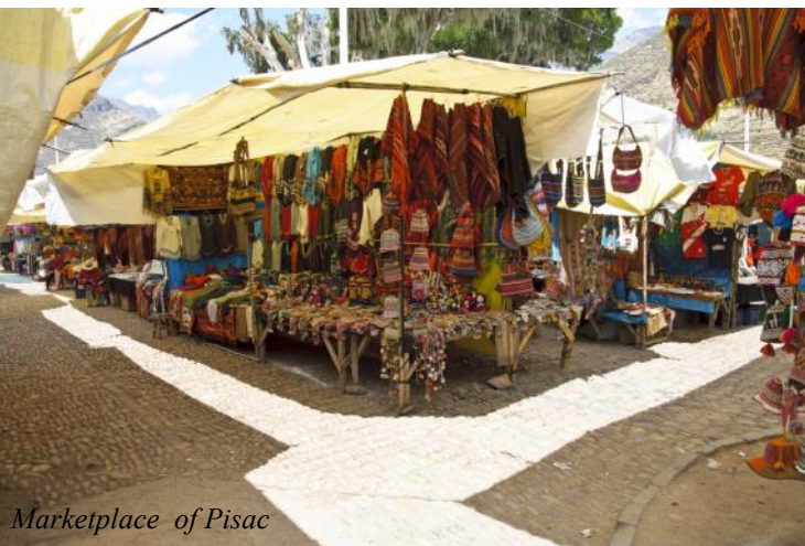
Marketplace of Pisac

A visit to one of South America's finest museums, the Peruvian Museum of Archaeology, Anthropology and History begins our day. Here we find a fascinating collection of ceramics dating back 2,500 years, some of the best-preserved mummies in the world, and intricately engraved obelisks. The museum is housed in a mansion which was used by Peru's liberators, José de San Martín and Simon Bolívar. This afternoon we have some time to explore the Miraflores district: people watching in the centrally located