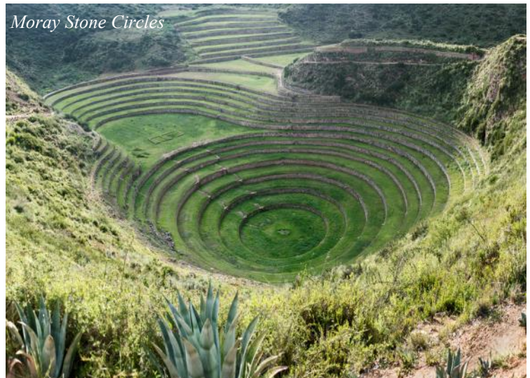
Moray Stone Circles

This is a day for exploring the valley. First we visit Pisac and its authentic marketplace where we can try out our Spanish and get some experience in bargaining with the Quechua vendors, descendants of the Incas. We next visit the Moray Stone Circles , an amphitheater-like construction dug into the earth which is believed to be a former Incan crop laboratory. We also stop at the Salinas de Maras , where