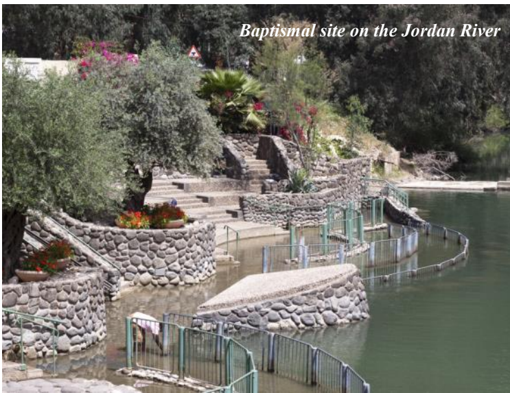
Baptismal site on the Jordan River