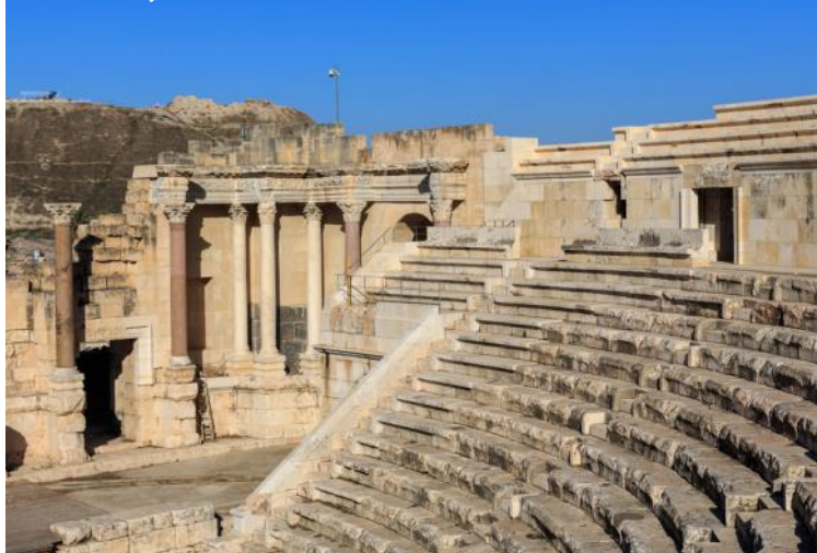
Roman city Bet Shean