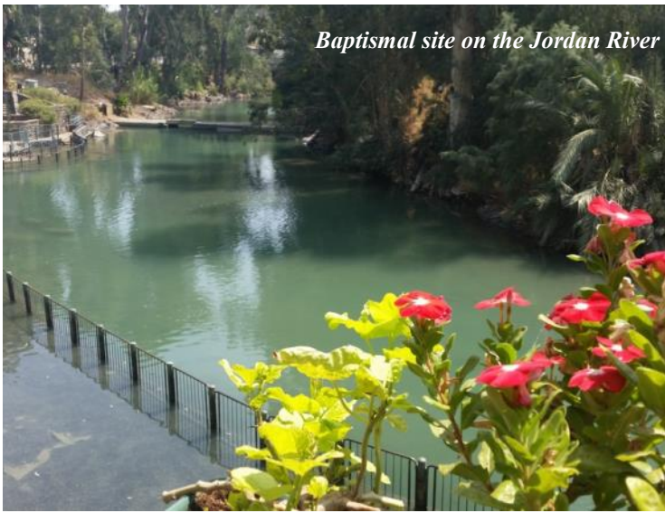
Baptismal site on the Jordan River