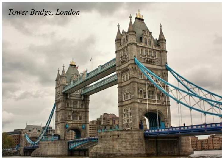
Tower Bridge, London

cloisters to see the locations where several Harry Potter scenes were filmed. We have some free time before heading back to London. B, L