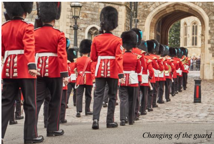
Changing of the guard

Abbreviations for Meals B=Breakfast, L=Lunch D=Dinner