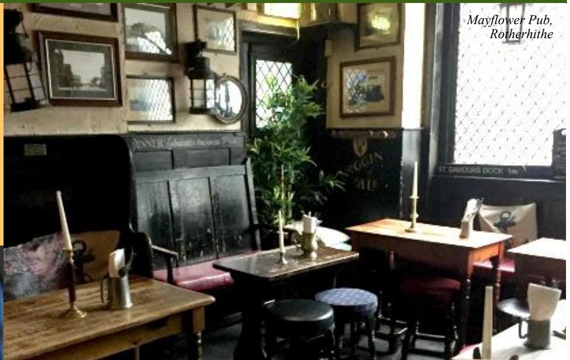
Mayflower Pub, Rotherhithe