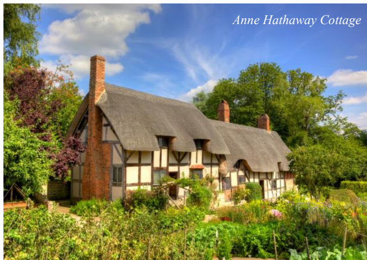
Anne Hathaway Cottage

arrested and taken to the Guildhall. We will see the cells where they were held in the Guildhall. St. Botolph's Church, known as "Boston Stump," is one of England's largest parish churches. Rev. John Cotton urged members of his congregation to join the Massachusetts Bay Company, and he helped found the city of Boston in the 1630s. The Puritan Path leading to the church is in his honor. We will have lunch in Boston, then continue our journey into London and the evening will be at leisure. Tickets to a West End show can be arranged. (B/L)