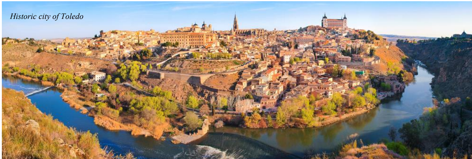
Historic city of Toledo