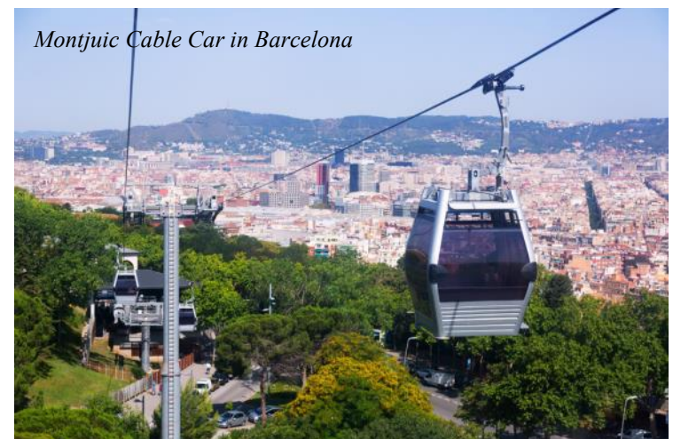
Montjuic Cable Car in Barcelona

Abbreviations for Meals B =Breakfast D =Dinner