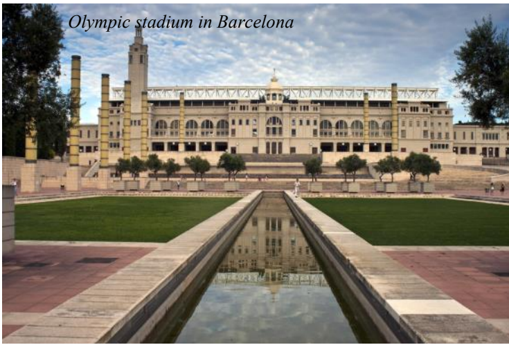
Olympic stadium in Barcelona