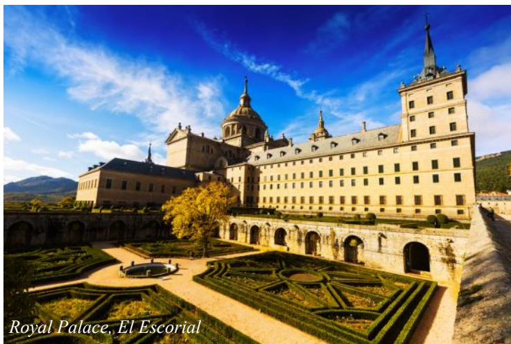
Royal Palace, El Escorial

Today we travel a short distance from Madrid to El Escorial. The grandiose palace, mausoleum, and monastery of San Lorenze de El Escorial are located here, where the bodies of every king since Carlos I, save three, are buried. On the return to Madrid we stop to visit Valle de los Caídos , Franco's stupendous monument to his troops who fell in the Spanish