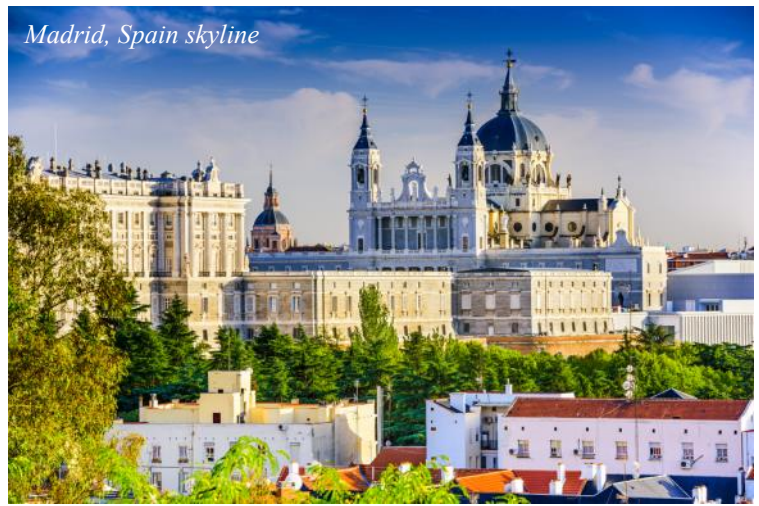
Madrid, Spain skyline

Civil War. Here 50,000 soldiers, and Franco himself, are laid to rest. B/D