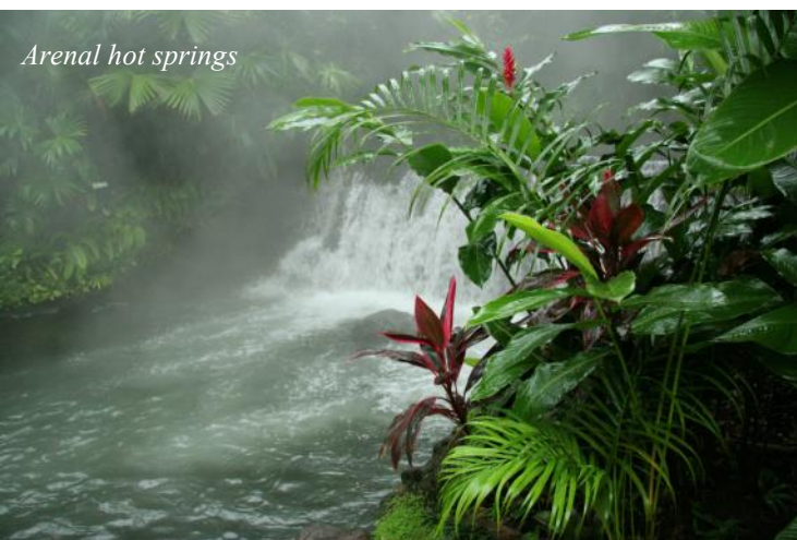
Arenal hot springs

Our day begins with a visit to the Arenal Hanging Bridges for a nature walk that takes us high above the canopy and across six suspension bridges! During the 1.86-mile walk, we get breathtaking views of the Arenal Lake , a waterfall and the majestic Arenal Volcano. After some free time for lunch, we experience the rain forest like never before – zipping by cable through the treetops! The La Fortuna Sky Trek system includes a cable car that takes us up the mountain and several cables that zigzag down the mountain. Participants are attached individually to the cables with two high quality harnesses, which support the body so that you feel as though you're sitting in a chair.