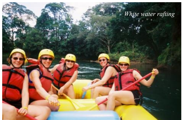
White water rafting

Over the next 6 days we are immersed in language and culture. For four hours each day for a full week we attend classes at Intercultura Costa Rica where we are introduced to all things Costa Rican. We'll enjoy Latin dance, music, and cooking classes in addition to our intensive language classes. Optional evening activities are also offered in addition to spending time with our