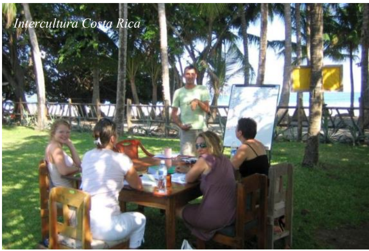
Intercultura Costa Rica

Costa Rican families and friends in Heredia. We have an extra day after the course concludes to be with families. B/D