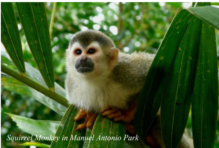
Squirrel Monkey in Manuel Antonio Park

Today a private naturalist guide introduces us to the Manuel Antonio National Park . A conveniently paced nature walk through the park will afford us the opportunity to view an abundance of wildlife. This is where white-faced monkeys have been known to steal snacks from knapsacks! We sample some tropical fruits on the beaches of the park at the end of our tour. After dinner we return to San José. B/D