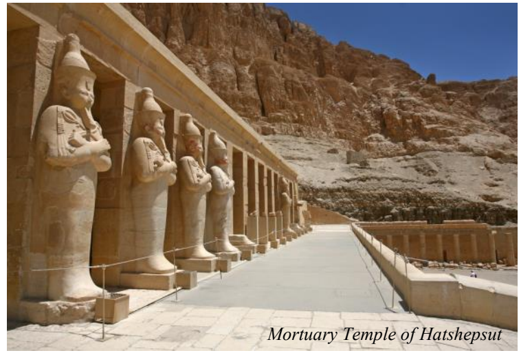
Mortuary Temple of Hatshepsut