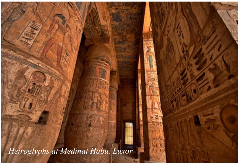
Hieroglyphs at Medinat Habu, Luxor

We conclude our tour with a sailboat ride on the Nile and visit the Botanical Garden of Aswan, planted by Lord Kitchener, the British ruler of Egypt. Returning to the ship, we begin our journey on the legendary Nile. Watch the scenery pass from the pool or your sunbed lounger. Our first stop is the Temple of Kom Ombo, dedicated to the Crocodile God Sobek and the Sky God Horus. We continue to Edfu where we dock for the evening. (B/L/D)